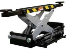
QRJ04H: 4,500 lb. Capacity Rolling jack