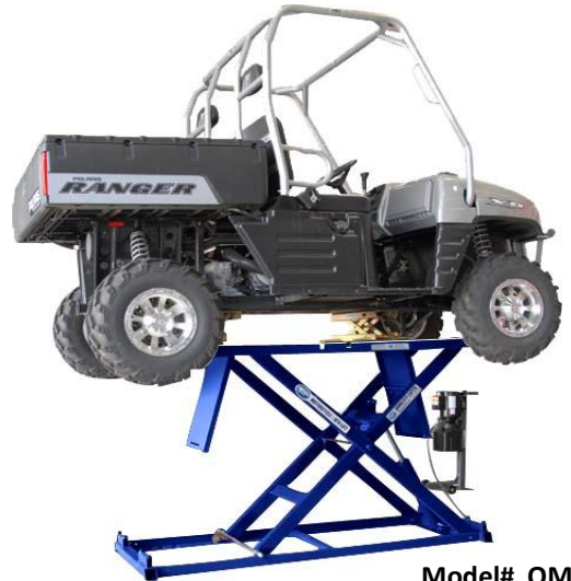
Model# QML02E 2,000 lb capacity electric/hydraulic operated motorcycle/UTV lift